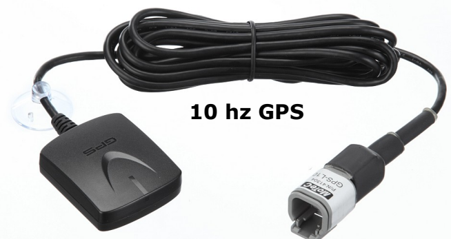
10 Hz GPS