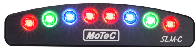
SLM-C Shift Light Module