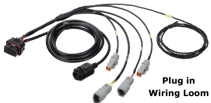
Plug in Wiring Loom