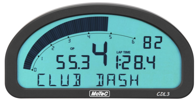
CDL3 Club Dash Logger